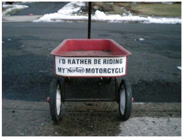
Pretty much says it all!

So let's do a recap of the past three club meetings so far this year.