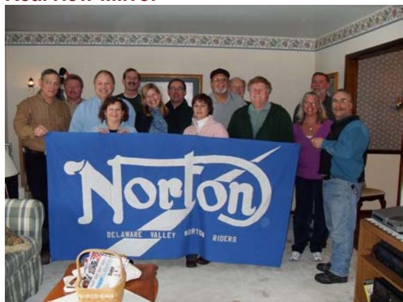
Celebrating 25 years of good times. Cheers!