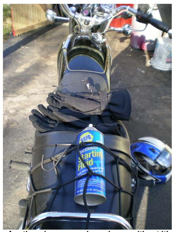
Another view - never leave home without it!

Scribe Richard was off-site somewhere having fun so Kathy Gehrhardt volunteered to perform the documentation duties and offers the following observations.