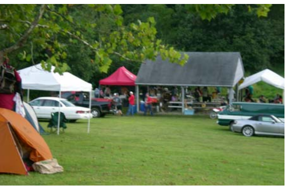
Rally Central especially during Saturday's all day rain

The group arrived at the campground in time for adult beverages and the splendid Friday evening meal.