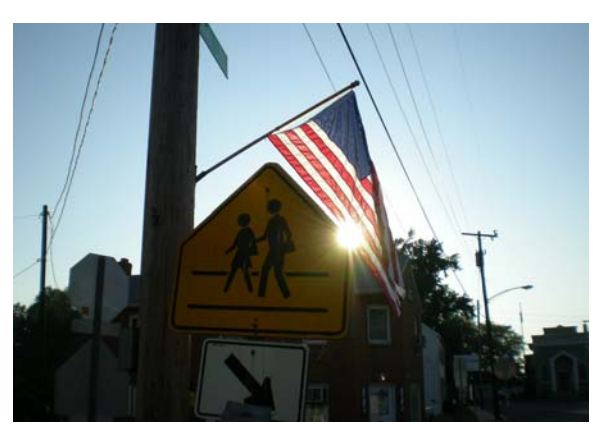
First stop of the day, Poolesville, MD

On any morning of the work week, navigating the byways and highways of Montgomery County Maryland can be SLOW. Trying to go south into Virginia during morning rush is even SLOWER.