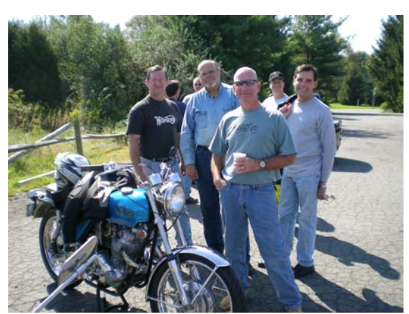
September ride kick-off, Brass Ring

Our November meeting occurred last weekend. Thanksgiving is upon us. Yikes! Where did the year go?