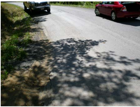
Lots of scattered stones across the road surface – looking back up the road

Within 10 minutes of the crash, the first emergency responders were on scene. Within 15 minutes, Virginia State Police, the local fire department, and medical emergency services personnel were also on scene.