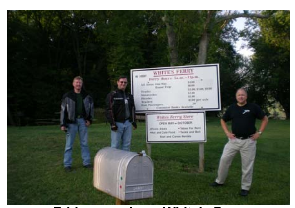
Friday morning – White's Ferry

Our arrival time at White's Ferry was spot on – we just missed the outbound departure. Round trip on the ferry is about 15 minutes thus giving us time to stretch and snap a few photos.