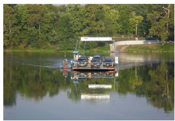
Commuters from Virginia crossing the Potomac at White's Ferry

In case you are wondering, the ferry operator charges motorcyclists half the price of an auto - $2 versus $4. Ferry service at this crossing dates back to 1782 and currently operates year round river conditions permitting.