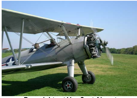
Rare sights at Van Sant Airport

The usual crowd was enjoying the sights and sounds of the piston-powered airplanes pulling gliders or taking visitors for scenic rides over the river valley.