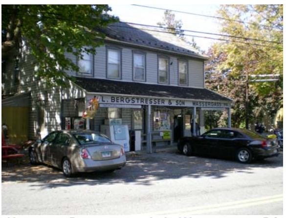
No gas at Bergstresser's in Wassergass, PA but the strudel is to die for

Richard led the group on an autumn colored ride through the woods and hills and across the creeks along the Delaware River watershed. Our destination was Richard's home hidden back in a hollow above Upper Black Eddy.