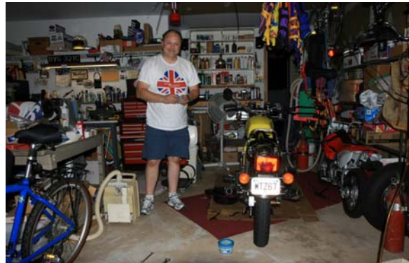
Editor and the '73 Norton

This issue is a celebration of a successful event that was more than 2 years in the planning and a testimonial to the event and the people involved.