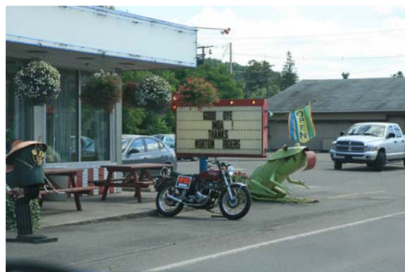
Goodbye INOA – thanks Norton riders! The Frog Hut, Wellsboro