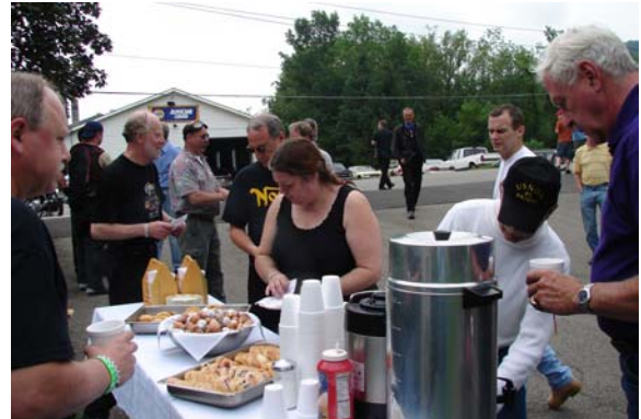
Mid-morning refreshment break

An hour into the ride, the group stopped for coffee and snacks at a pre-arranged locale.