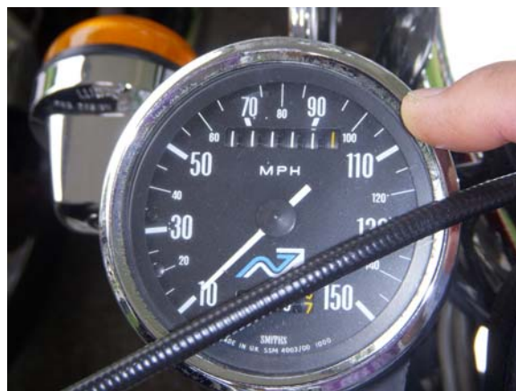
Good Karma – 11,111.1 miles

Our Saturday departure to the rally was dictated by our reservation for a 28' RV rental which had to be picked up before 1 pm that day just east of Williamsport.