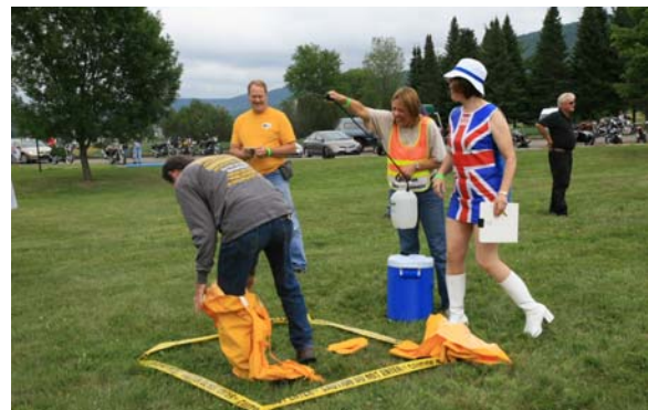
The wet rainsuit contest run by the MNO

Field events were held Wednesday afternoon in the big field next to the tent. The Michigan Norton Owners were kind enough to plan and run the games. Weather was wet right up to starting time – then the sun came out. Those Wolverines went to work and set up in record time.