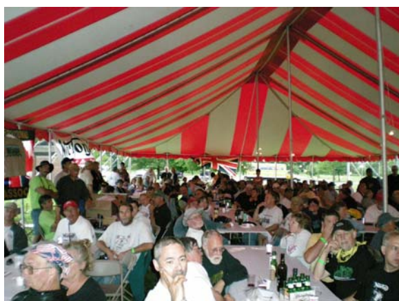
Everyone hoping to hear their number called