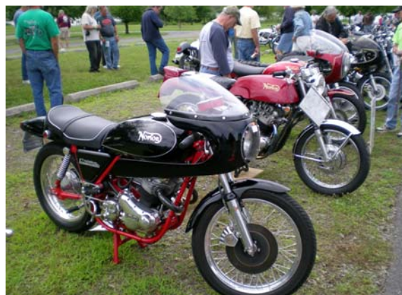
Concours Thursday afternoon

After a quick photo session it was back to Ives Run for the mid-afternoon concours followed by the awards banquet.