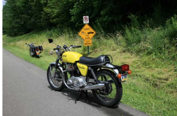
Share the Road with Nortons