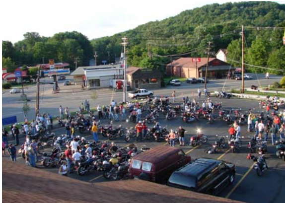
Tuesday Bike Night in Wellsboro