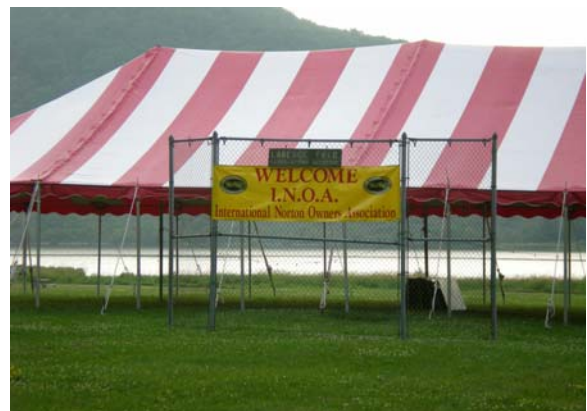
Quite the accomplishment!

Steve predicted we would have the tent erected in 4 hours. We did it in 3 – good thing we did 'cuz the high winds and heavy rain hit 20 minutes later!