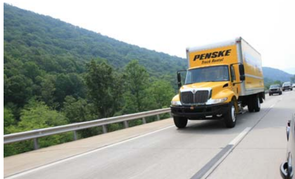
Saturday morning heading west on I-80