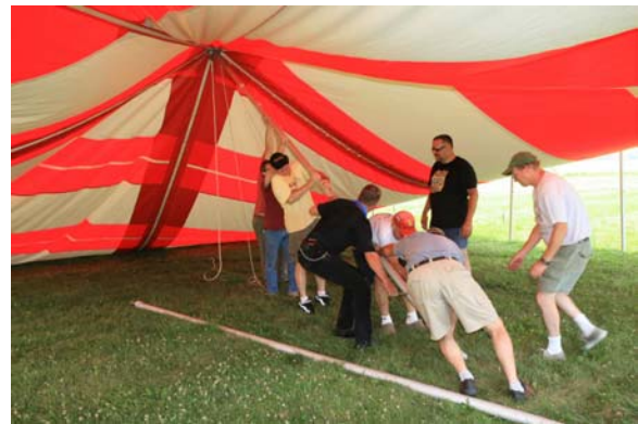
1, 2, 3 PUSH! The first of 3 poles goes up.

Our only concern with the tent raising was sufficient manpower – would we have enough volunteers to get the job done before the forecasted storm hits later that afternoon?