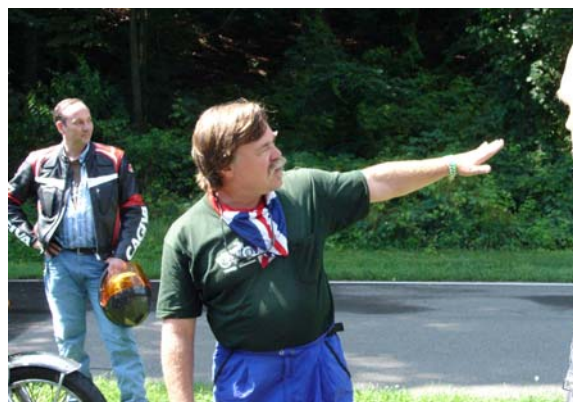
The road went that away and Dad went the other way