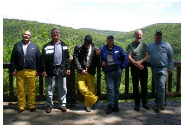
Definitely not the Nortie Girls – West Rim

Wouldn't you know it? By noontime, the sun was out and the roads drying off. A few of us were lingering about rally central and decided to do an ad hoc group ride to the west rim. Fun is where you find it.