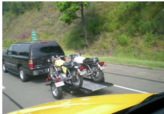
Nortons in tow heading west

Fast forward to Saturday morning – departed the Norum hacienda around 9 with Tari and Chris in the Yukon with Nortons in tow, your editor driving the Penske complete with 'air chair'. The 'air chair' is a devious device – too much air pressure in the snubbers and 'to the moon Alice!' when encountering a bump in the road. The seat required some fine tuning before finally finding the sweet spot. Via cell phone communication, Alan caught up to our convoy north of Quakertown on the Turnpike Northeast Extension.