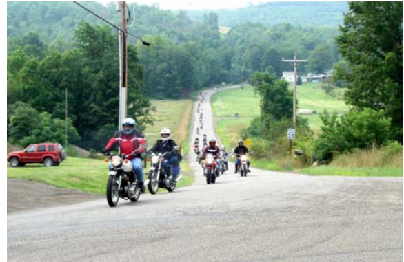
The road to Watkins Glen