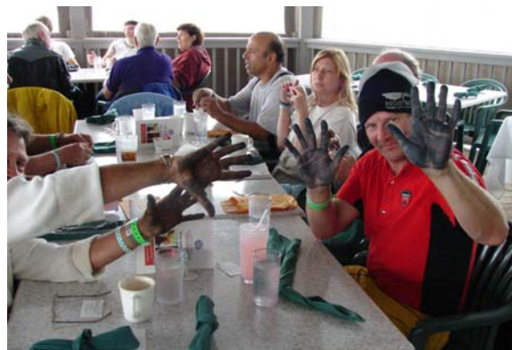
Riding in the rain with black leather gloves

his fellow competitors and was ready to race in the Grand Prix, finishing 7th.