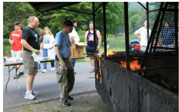
Cooking on one end of a very long grill!