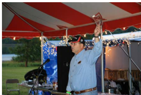
Accepting the Chapter of the Year Award

Ride smooth, ride as often as you can, and remember to ride the Norton!