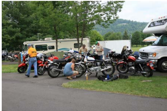
Michigan Norton Owners staging area

Our RV was right off the main road through the campsites and it was tough trying to focus on a number of chores that needed to be done with the constant stream of Rally attendees passing by on the way to their sites.