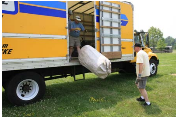
Mail Call! – Oops - Tent Call!

The corners were marked and the process began.