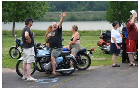
Those irrepressible Canadians!

And by the time we fired the BBQ Monday evening for the CONO/NONO sponsored hot dog and hamburger eating contest, some folks were simply ecstatic just to be there.