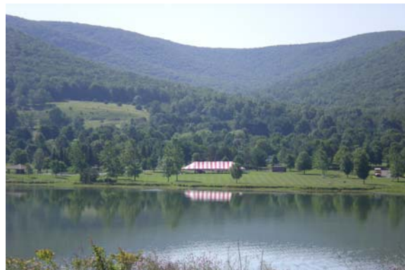
Friday – perfect morning

unspoiled view of the campground, lake, and the big, red tent. Instant memory.