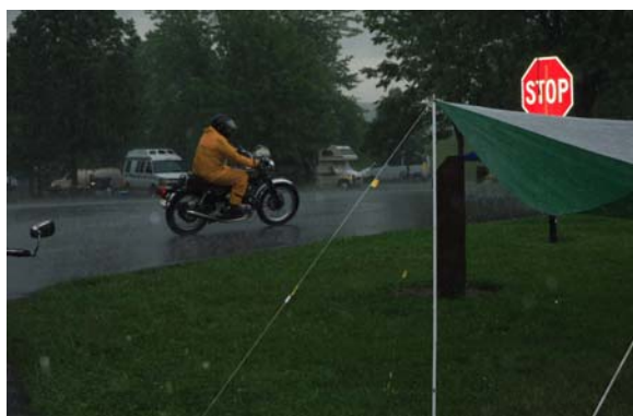
Night time? Nope, 11 am Thursday

Thursday morning was supposed to have dawned sunny and warm for the group ride through Wellsboro to the west rim of Pine Creek Canyon. Instead of sun, heavy rain was pounding the area forcing the decision to cancel the ride.