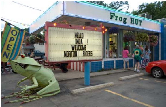
Welcome INOA! – Wellsboro, PA

It is 2 months since the conclusion of the finest National Rally in the history of the INOA. Perhaps a bit of hubris on my part but what the hell, why can't I boast about our club, our members and friends!?