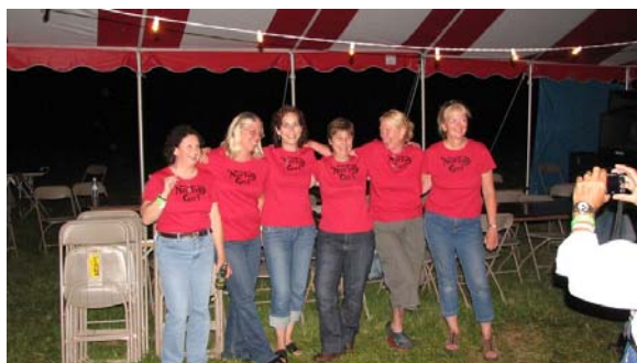
The Nortie Girls

Here's another spy photo of a senior leadership team building exercise Wednesday under the big tent.