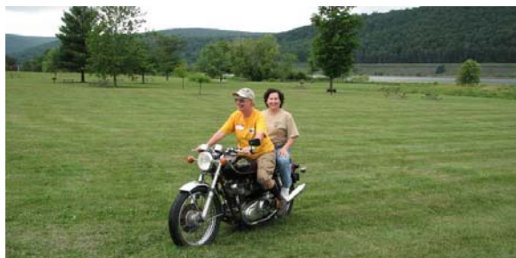
INOA Prez & Membership Secretary at off-site meeting