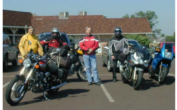
Modern day Merry Pranksters?

Charlotte snapped a photo as we prepared to depart after eating our fair share.