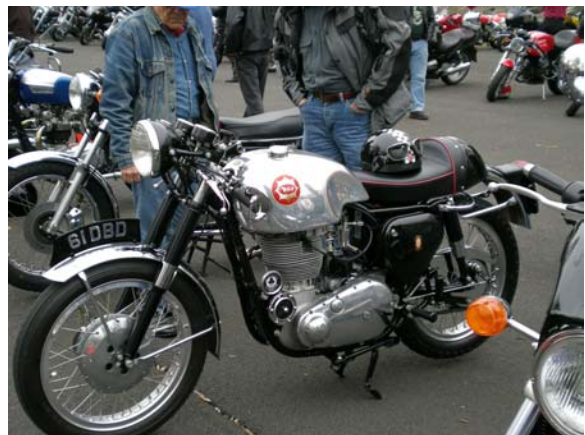
A beautiful Clubman Gold Star with alloy tank