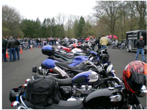
Lots of Triumphs – both new...