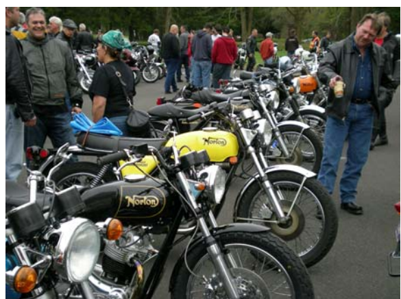
Close up of Commando line up