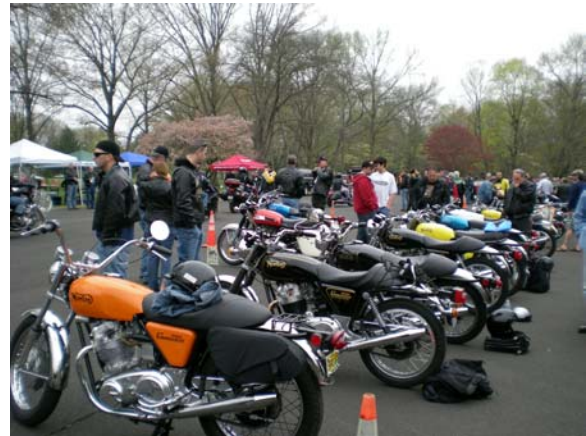
First Group – opposite end