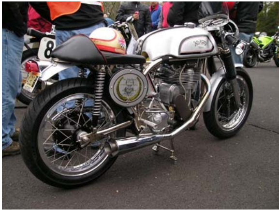
Here's a special bike

An incredible brand new Manx Norton set up with lights, instruments and a NJ license plate! The workmanship, fit and finish was incredible – nickel plated frame, beautiful alloy engine plates, and a ton of nice "bits". The owner bump started it twice, and it sounded great. The side plate displayed a nice tribute to Mike Hailwood.