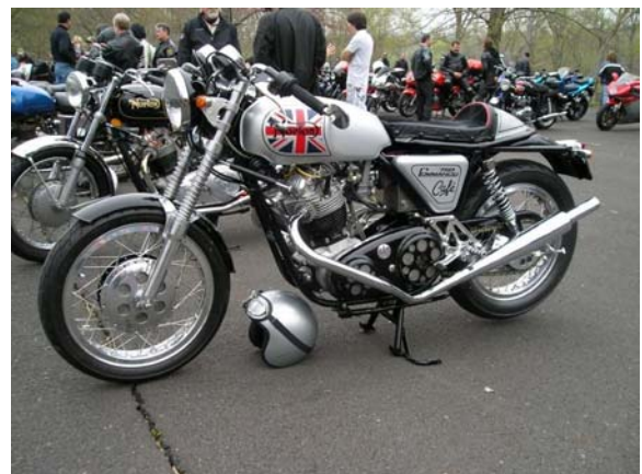
750 Café Commando – very sweet

Least I forget a special thanks to Rich Casey for judging the Concourse line up. Never an easy task but always fun! Due to the anticipated size of the event, we decided early on this year that the prizes would be limited to Judges Choice 1 st , 2 nd , and 3 rd places for Nortons only.