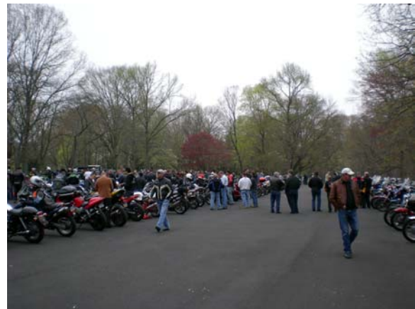
View from north end of parking lot