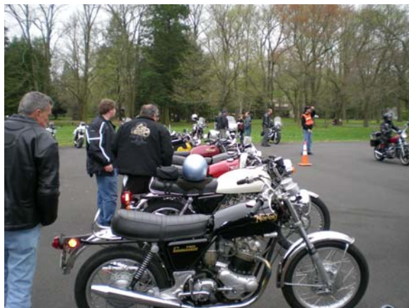
DVNR Norton line up – second group