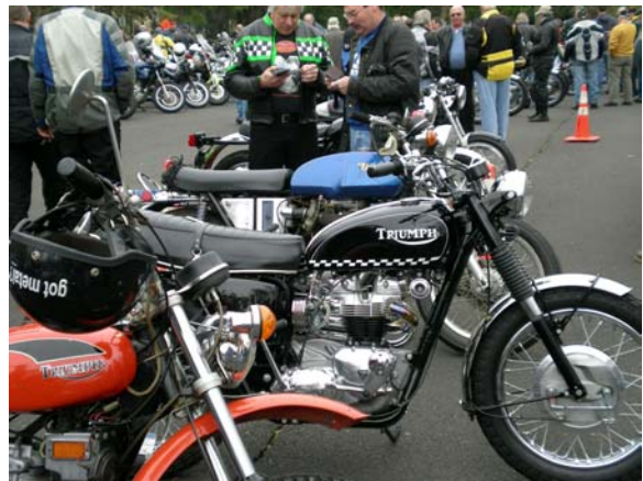
... and old – love those lines.