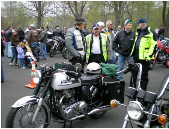
Atlas-based long distance tourer