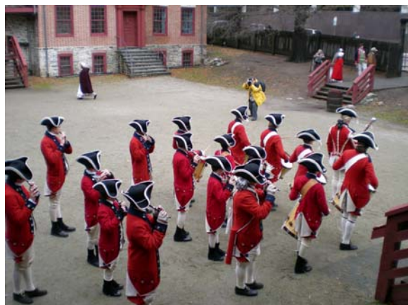
The beginning of the Norton influence in the Colonies – Old Barracks, Trenton

This year started out a bit slow but has been gaining a head of steam ever since the end of January. I've been 'learning the trade' so to speak as your newly elected club President. There has been considerable behind-the-scenes activity in support of National Rally planning, website administration, our recent Gathering event (wow!), and all the normal stuff.