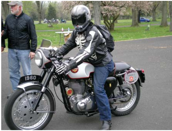
... another nicely modified Gold Star with a pumper carb and a Munch 41s front brake