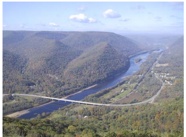
view from Hyner View facing upstream of West Branch of the Susquehanna River toward Renovo

The overlook is very popular with hanggliders - must be quite the view looking straight down from under your wings.