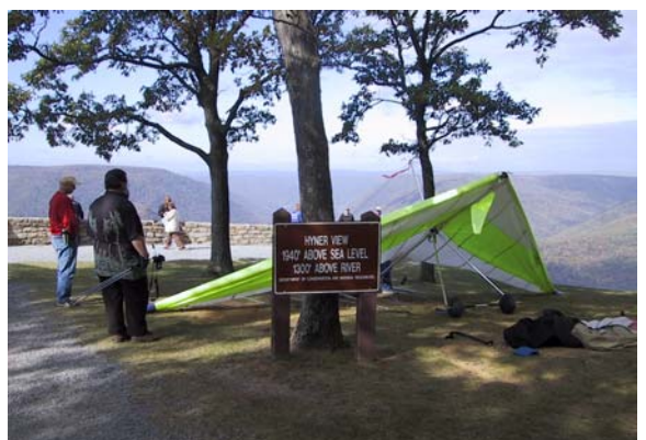
Hang gliding at Hyner View

It is a challenging as well as extremely scenic ride. You don't want to run off this road! At the bottom, you turn left into Hyner View State Park and follow the narrow, twisty road to the top of the overlook which is 1,940 feet above sea level and 1,300 feet above the river below.