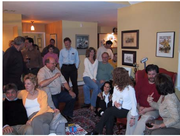
Nortoneers doing what Nortoneers do best!

Regardless of your choice in clothing, everyone had a hoot and vowed to return next year!