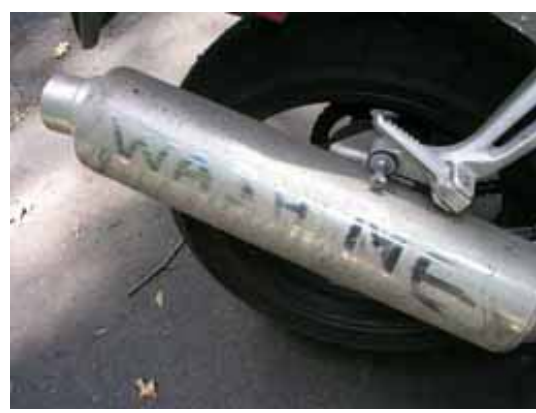
"Wash Me" was all my SuperHawk had to say about the ride!