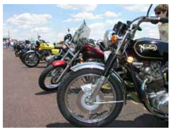
DVNR Nortons line up along the VanSant Runway.

Thanks Bob for introducing us to some really nice roads! If the goal was to cross Route 12 as many times as possible I say we scored a good bakers dozen!