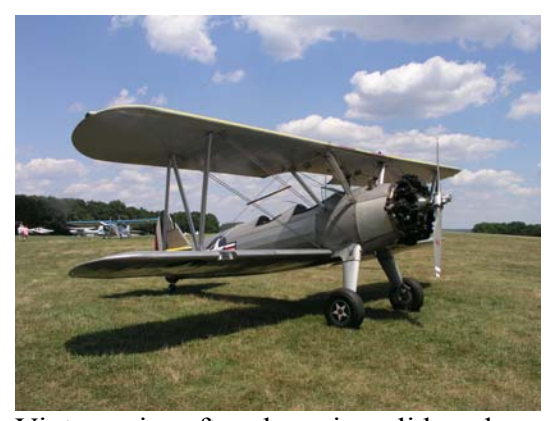
Vintage aircraft and soaring gliders draw many motorcyclists to VanSant Airport in Bucks County, PA.