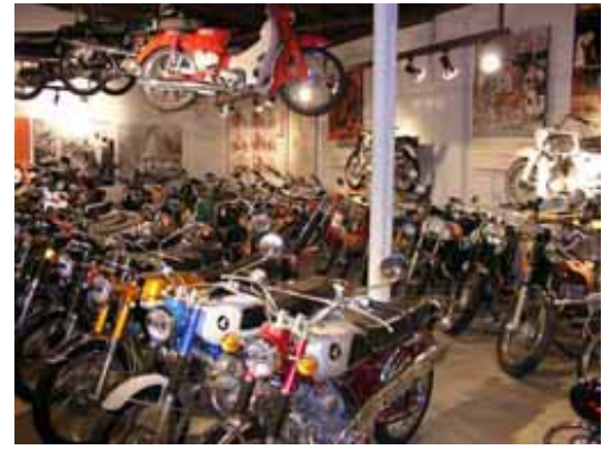
Bob Logue's dealership houses an incredible collection of antique and vintage bikes and motorcycles.