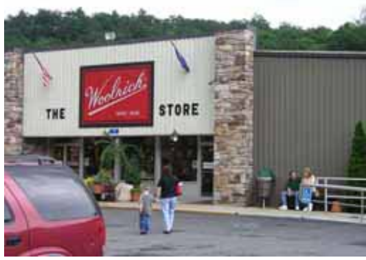
The Woolrich store was another stop of the day as we dodged the rain and enjoyed some shopping.