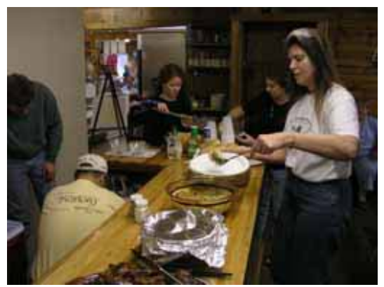
The Fin, Fur and Feather provided an unbelievable assortment of great food for the rally's barbeque.

Although rally attendance was limited, those who persevered now have some memories to cherish and stories to tell about the 2003 DVNR Rally.