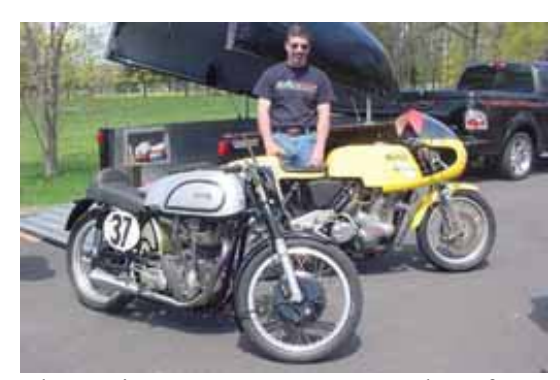
These vintage racers are examples of Norton's "Glory Days" and captured everyone's attention.